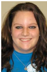
Autumn Appis 4-H 2009